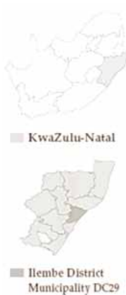
Map of KwaZulu Natal and Ilembe District

In 2002, life expectancy at birth was 47.5 years and infant mortality was 68 per 1,000 live births. In 2004, the province's HIV prevalence among pregnant women at antenatal screening sites was 40.7, ranking highest in South Africa. With more than 120,000 AIDS orphans (maternal) in 2002, the province has the highest number of AIDS orphans in the country (Day et al. 2005).