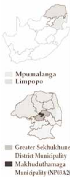
Map of Limpopo, Mpumalanga, Sekhukhune, and Makhuduthamaga