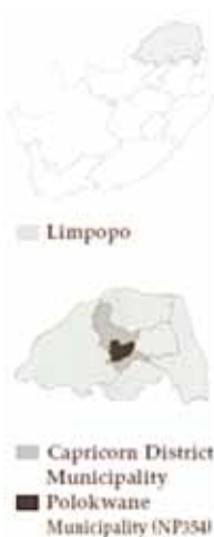
Map of Polokwane Municipality

Forty-eight percent of the households earn an income of less than R1.600 per month, while 42 percent of the households have no formal income at all (Gaffney 2005).