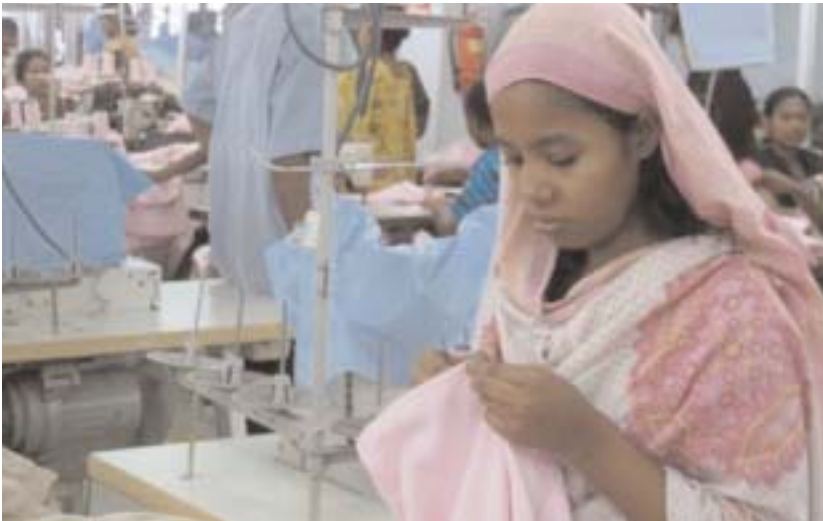
Accelerating globalization, which carries the transformative power of new markets and new technology, can invalidate traditional expectations regarding future employment prospects and life experiences (photo: Bangladesh).

and their countries' future. In the panel's view, policies and programs, if they are to be effective, must be evidence-based, locally appropriate, and designed in cooperation with developing-country governments and local communities.