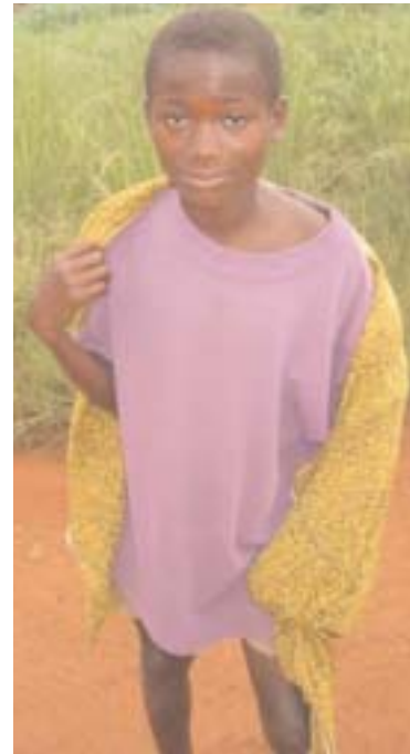
Poverty is the greatest barrier to making a successful transition to adulthood (photo: Ghana).

The panel recommends that policymakers increase the provision of general health information and sex education, including negotiating skills, for all young people and increase the availability of reproductive health services for those who are sexually active. Some of the most impor-