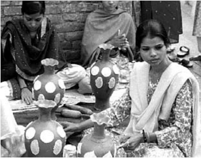
Participants in the experimental area attended vocational training classes. Over a period of ten months, 19 vocational courses were offered.

likely than the matched control respondents to know about safe locations for unmarried women to congregate, be a member of a group, score higher on indexes measuring social skills and self-esteem, be informed about reproductive health, and spend time on leisure activities. On the other hand, the project did not have a demonstrable effect on gender role attitudes, mobility, work expectations, time use, or labor market work, likely because of the short duration of exposure, as well as the limited number of times that groups convened.