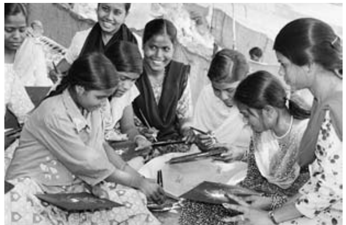
Livelihoods programs have the potential to increase the agency and decisionmaking power of young women.

The Population Council and its partners are promoting a “livelihoods approach” that aims to expand the decisionmaking power of young women by building social networks and developing financial and income-generating capacities. As broadly conceived, the livelihoods approach to adolescent programs attempts to provide technical and life skills and seeks to transform the ways in which girls view themselves and are perceived by others in the community. Although a wide variety of livelihoods programs for adult women exist in India, few focus on adolescents. Of those that do, few employ rigorous scientific methods to evaluate the impact of the program.