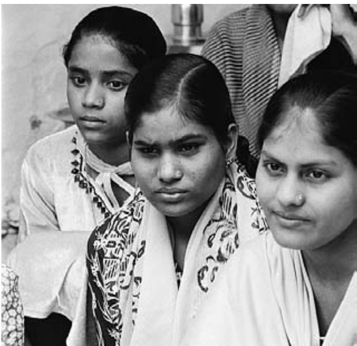
Unmarried girls need and appreciate spaces where they can congregate safely and develop their skills.

Nearly 80 percent of participants completed two or more courses. Peer educators also discussed various savings options available in the community and helped girls open savings accounts in their own names. All accounts were opened in post offices, which offered