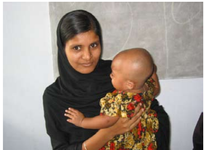
Young wives often find themselves with few friends, limited exposure to modern media, and less freedom of movement.

Studies undertaken in a variety of settings reveal a range of characteristics common to married girls, including the following: