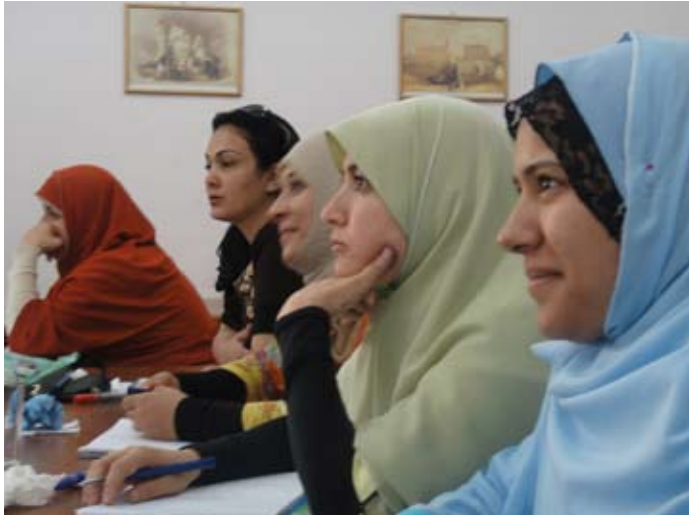
Ishraq graduates continue to learn and gain skills.

In 2010, the Girls' Club model was replicated in an additional four villages each in el-Minya and Beni-Suef targeting 215 graduates.