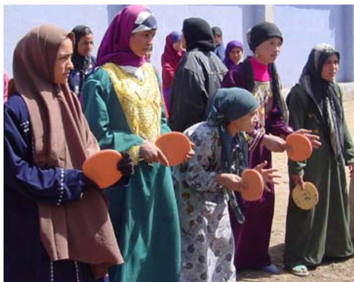
Pushing boundaries but not transgressing norms: Girls participate in sports for the first time.

According to the Egyptian Labor Market Panel Survey of 2006 (Barsoum 2006), 26 percent of Egyptian girls aged 13–19 in Upper Egypt either received no schooling or dropped out after just one or two years. Each passing year spent out of school makes a lifetime of illiteracy and poor economic prospects more likely. Low levels of education also leave girls without the requisite knowledge, autonomy, and self-confidence to oppose practices that they might otherwise resist, such as female genital mutilation/cutting (FGM/C) and early marriage.