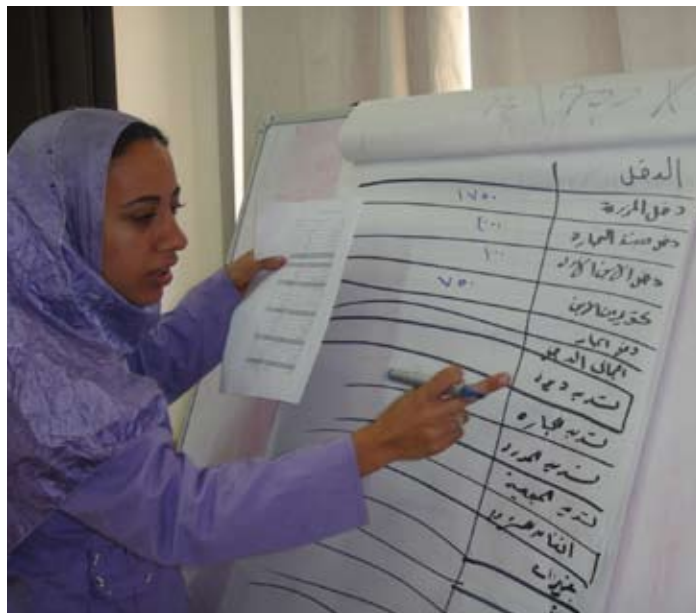
Learning new skills—both numeracy and financial literacy—helps girls move forward.

The Ishraq program consists of literacy training, a broadly defined life-skills curriculum, and, for the first time in rural Upper Egypt, sports activities to enhance leadership and team-building skills and prepare girls for integration into formal schooling. For 24 months, girls meet approximately four times each week for three-hour sessions at youth