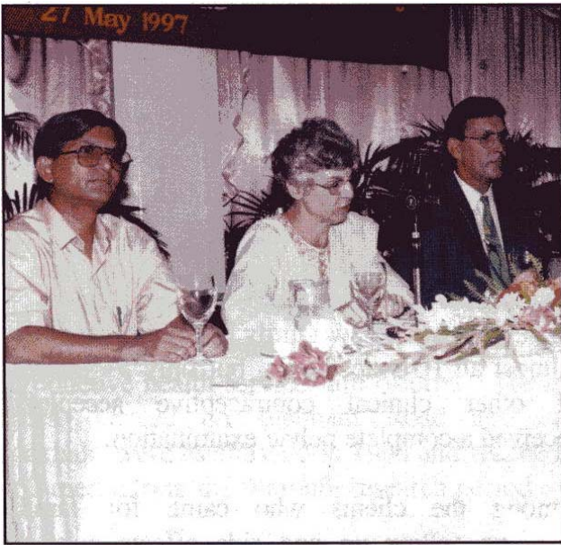
The panel for the traditional family planning study.

Examination of the facilities showed that most had the necessary space, equipment, and supplies to conduct routine RTI services. Most providers had training on family planning and MR, as well as some orientation on RTIs as part of these trainings. The majority understood the relationship between RTIs in women and risks associated with infected partners. Yet, in spite of these positive findings, appropriate RTI services were rarely offered.