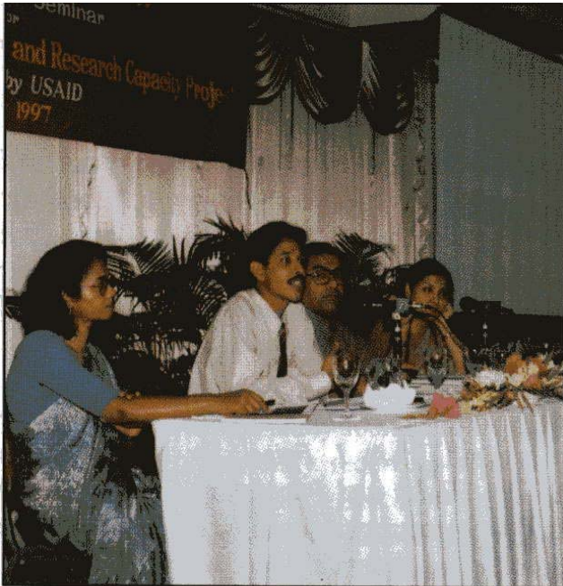
The teams for the MSC and RTI studies present their findings.

PC worked with MSC to increase the knowledge and skills of the clinic staff to serve STD clients.