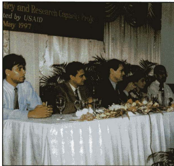
The team for the costing study responding to question.

Quite importantly, for both GoB and NGO areas, virtually no current pill user indicated that she would stop using a modern contraceptive in response to a price change. A very small proportion (about 1 percent) would switch