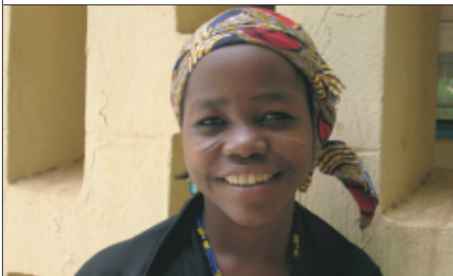
Child marriage, which is common throughout francophone West Africa, receives little visibility and little funding from donors for programs to reduce the practice, despite its link to increased rates of maternal mortality, fistula, and HIV/AIDS.

Early marriage increases social isolation and launches girls on a cycle of poverty, gender inequities, and high risk of dying from pregnancy and childbirth. Child marriage is a violation of human rights. It forces children to assume responsibilities and handle situations for which they are often physically and psychologically unprepared.