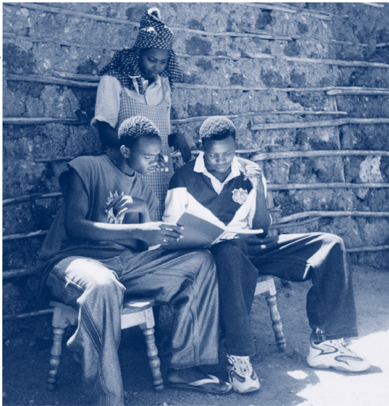
A community health peer educator and two young men look through a publication on adolescent reproductive health.

Communities and the participating ministries in both Kenya and Senegal expressed interest in incorporating elements from these interventions into their routine operations. FRONTIERS and its local partners launched follow-on projects in both countries to adapt, expand, institutionalize, and scale up the activities. This Program Brief describes the processes involved in institutionalizing and scaling up the multisectoral interventions.