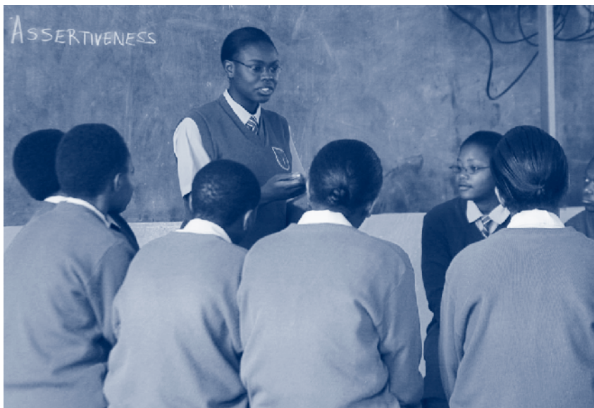
A schoolgirl and KARHP peer educator teaches life skills in Western Province.

The expansion projects followed different models. The Kenya project was a large scale-up effort, focused on institutionalization, replication, and rollout of KARHP activities within the three participating ministries at district, provincial, and national levels—including planning and budgeting (see Box 1).