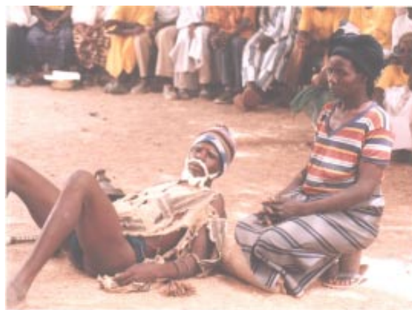
Male and female participants in Bindé present a play on the negative consequences of female genital cutting

“There is more involvement of traditional leaders in the fight against Female Genital Cutting and birth spacing.” (Female participant, Kondrin village, Béré)