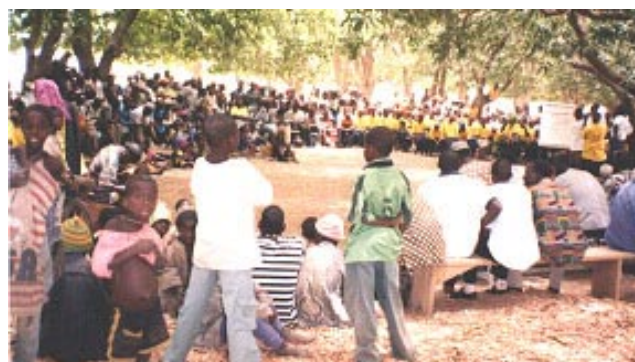
Inter-village meeting between delegates from five villages in Sondré (Béré district)

Class participants and the members of the Village Management Committees organized village meetings in each of the 23 villages to inform everyone of class sessions and activities. Class themes, along with strengths and weaknesses, were discussed and solutions proposed to the problems identified.