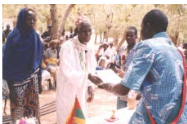
Public marriage ceremony in Bere; A female member of the audience and her husband receive their family record book after formalization of their marriage

Sixty-nine people participated in a workshop on gender-based violence. A case of discrimination related to children's education was noted.