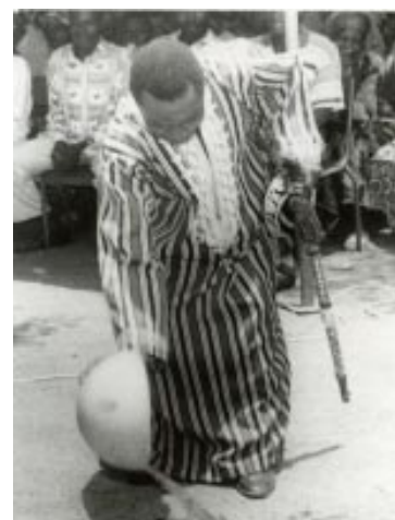
Through this ritual action, this man was given a mandate to support, in the name of their ancestors, the action taken by the women of Béré to abandon Female Genital Cutting