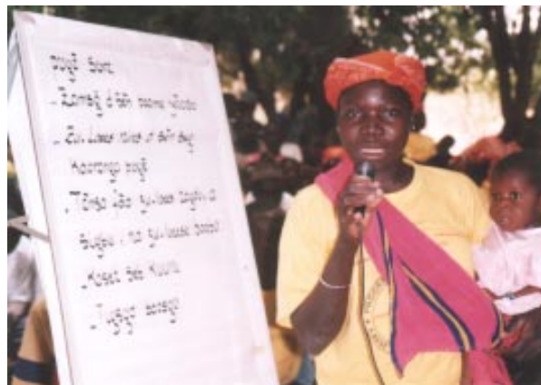
At the Sondré inter-village meeting; a female member of the Signoghin village class presents the problems that her village wants to solve

Villages sharing the same health centre (about eight villages per centre) met at the end of both cycles. During these day-long meetings, representatives from each village exchanged ideas about new information learned and activities implemented as well as pointing out strengths and weaknesses of the programme with the community leaders, development and administrative partners who attended. The participants also discussed and proposed solutions to problems that were common in all the villages. Six inter-village meetings were held. The first three were held at the end of the first two modules and the last three, at the end of Modules 3 and 4.