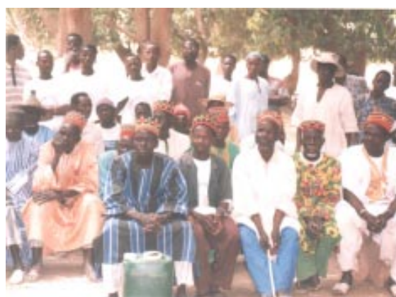
Participants who attended the inter village meeting in Sondré possible