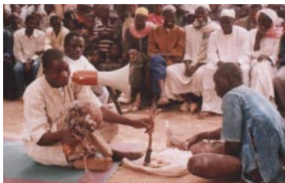
A scene from a skit during an inter-village meeting

identify community decision makers for the programme. A date was fixed with each village delegation to hold a general assembly for orientation and discussion with the entire village.