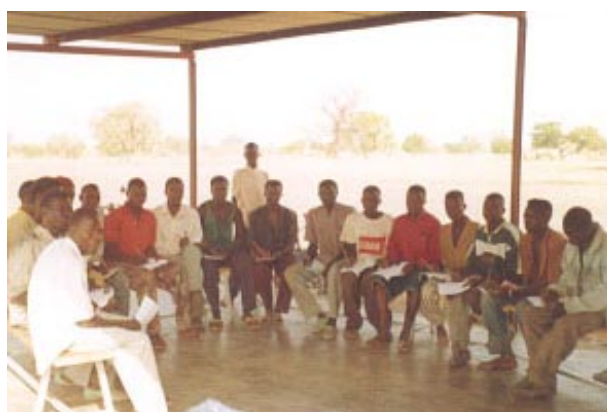
Session on problem solving with the participants of Nacombgo village (Béré district)

In participating villages, the idea was to inform everyone about new ideas being discussed by class members in order to involve them in the decision-making process. The villages that were not covered by the programme were also given information so that they could support the strategies the 23 participating villages developed. Everyone greatly appreciated these public sessions.