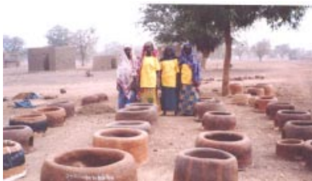
Female participants from Kondrin Village in front of the adapted wood stoves they constructed