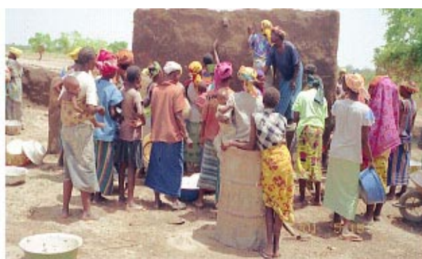
Women from Yorgho village in the process of building walls of the primary health center

Twenty-seven public sessions were held in the villages on the following topics: hygiene, FGC, sexuality, family planning, STIs and HIV/AIDS, pregnancy and vaccination. In addition, twenty-three groups for the promotion of health were established in each of the 23 villages.