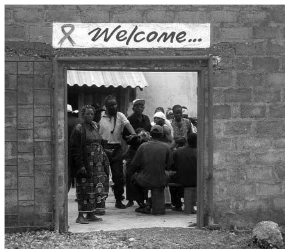
INTERNATIONAL HIV/AIDS ALLIANCE

Overall, a fourth to more than a third of community survey respondents had undergone HIV testing. In Ng'ombe, the Lusaka intervention site, figures were similar at baseline and endline, with approximately 39 percent reported having had an HIV test. In Bauleni the percentage increased from 32 percent at baseline to