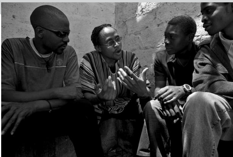
Treatment support worker talks to community members in Lusaka

Because of the increased demands resulting from the scaling up of ART, it is clear that the formal health system alone cannot carry out all the steps necessary to get large numbers of people to initiate and maintain treatment successfully, and to prevent further transmission of HIV. Therefore, innovative approaches are necessary to ensure effective coordi-