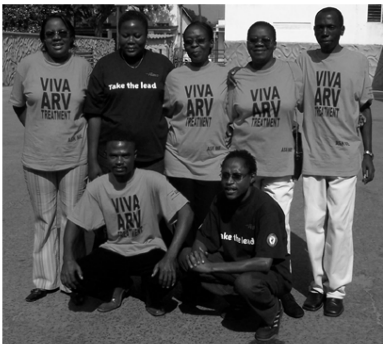
INTERNATIONAL HIV/AIDS ALLIANCE

In the survey with people on ART, around half of the respondents were sexually active; self-reported sexual activity increased significantly over the period of the study among participants at all sites, especially in the intervention sites. The vast majority of sexually active