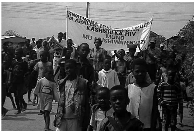
Launch of the ACER project in Ndola

At each ART clinic serving the Lusaka and Ndola intervention sites, there was a male and a female TSW openly living with HIV, working alongside the health care workers, and acting as referral contacts for people attending the clinics. Their main activities were to provide adherence counseling, information, referrals to community support organizations, and support for prevention practices and stigma reduction. In 2006, the TSWs provided adherence counseling to 1,944 people (846 males and 1,098 females). The TSWs also coun-