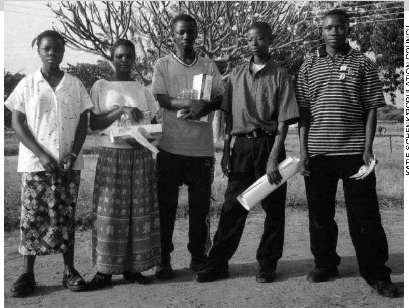
Trained youth caregivers in the Nchelenge district.

Study findings indicated that trained youth caregivers were able to meet a range of needs of PLHIV and OVC to the satisfaction of their clients and that their efforts contributed to decreased isolation and stigmatization of AIDS-affected families. Youth provided a broad range of services for PLHIV including domestic work, basic nursing care, counseling on positive living, and referrals. Youth also assisted OVC by engaging them in recreational activities, communicating with schools about their needs, and making referrals to NGOs if additional support was needed.