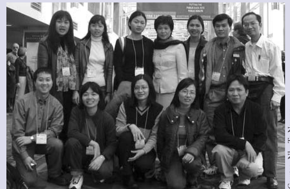
Vietnam public health fellows gathered for a group picture at the 2002 American Public Health Association annual meeting in Philadelphia.