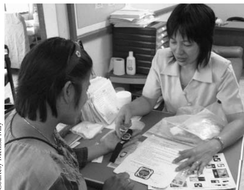
A participant in the ARV study learns how to use a watch with an alarm to remind her to take her medication twice a day.

Fifteen hospitals have been assigned to each study arm, for a total of 45 study sites. Findings from this research will be used to help strengthen and scale up the ARV treatment program throughout Thailand, whose leaders hope to have 50,000 people in treatment by the end of 2004. ■