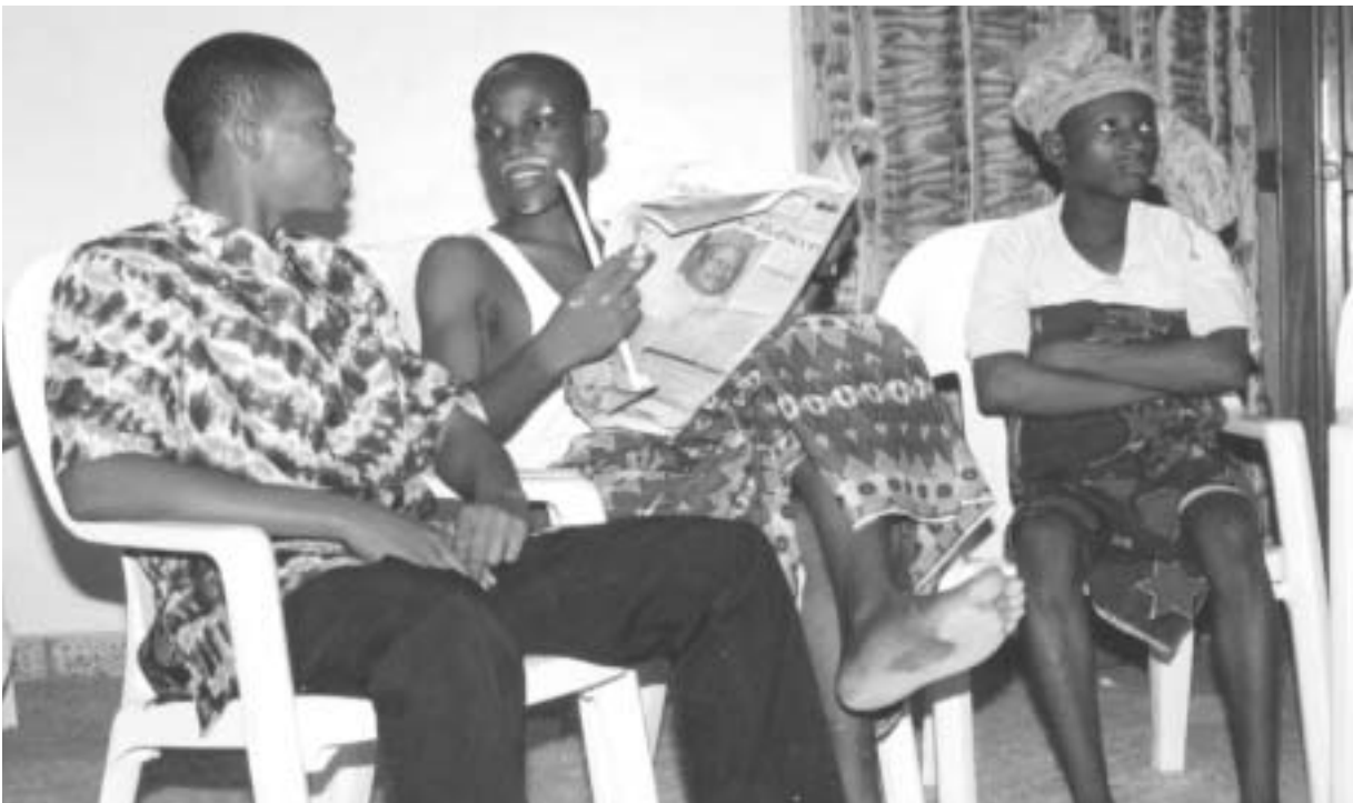
In a skit on marriage customs, the boys critiqued certain aspects of traditional Nigerian culture, such as brideprice, while also showing great fondness for many other aspects of their culture, such as its trove of proverbs.