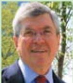
by Peter J. Donaldson

Outside of the family, schools are the main place where young people learn the skills they will need to succeed as adults. Education acts as a “social vaccine,” protecting individuals from child marriage and unintended pregnancy, improving their health and later their children’s health. It gives them skills to earn a living when they reach adulthood. Education plays a major role in national economic development.