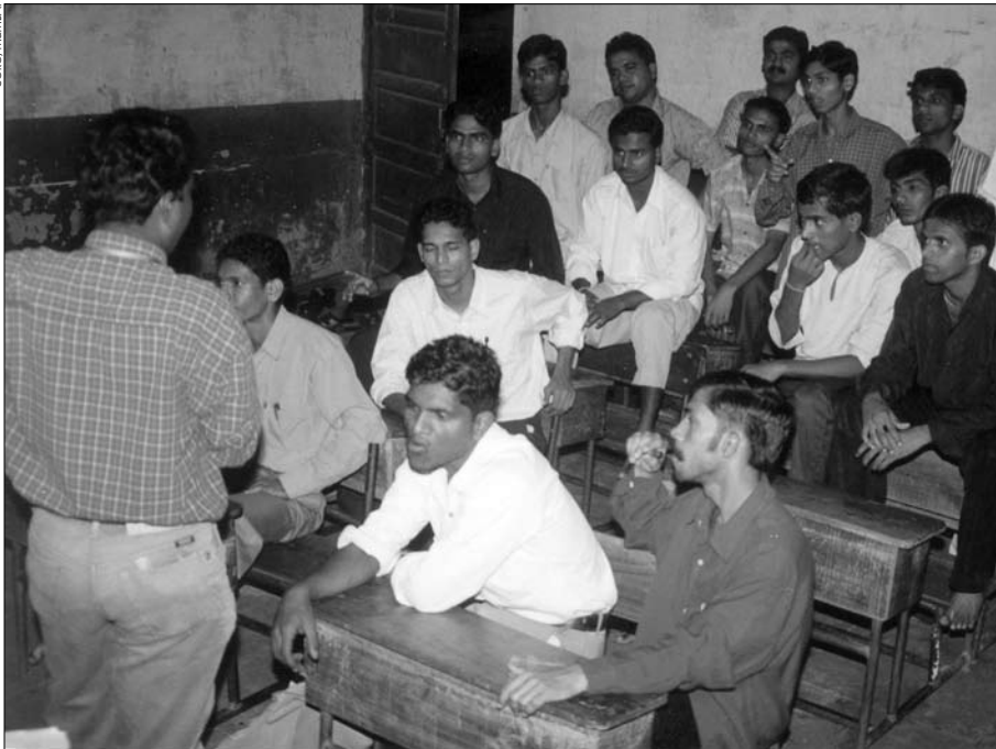
Young men participating in a group session on masculinity, part of the Yari-dosti program in Mumbai, India. This Horizons study showed that group-based interventions for young men can successfully improve factors related to HIV risk.

Facilitators of the group sessions in Brazil saw that it was important for the young men to participate in “male-only” groups, safe spaces to openly address various key topics. The young men appreciated the opportunity “to be here among men and to be able to talk” [24]. In India, the sessions prompted intense debate and discussions, and young men often drew examples from their own life experiences, an indicator of the relevance of the methodology and the themes for their personal lives [5].