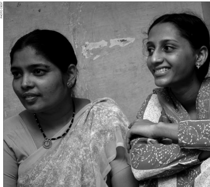
In India, Horizons expanded the work on gender equity and HIV prevention to women, focusing on self-esteem and critical thinking.

Future initiatives should also explore possibilities for programs that target gender norms in different settings and scale up success stories. Such strategies as the small-group educational workshops about gender norms could be inexpensively and efficiently integrated into many existing programs, such as school-based and community-based HIV education activities, voluntary counseling and testing initiatives, and