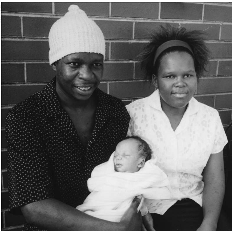
Horizons researchers found that gender norms that frame pregnancy as a woman's domain may prevent male involvement in antenatal care in Zimbabwe.

Likewise, in Brazil, endorsement of inequitable gender norms was significantly associated with reported STI symptoms, less contraceptive use,