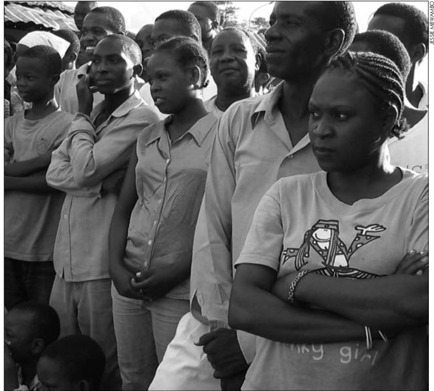
In Tanzania Horizons research found that many male and female youth distrust their sexual partners and accept partner violence as the norm.

In Tanzania, qualitative research revealed the interrelationship between violence against female partners and infidelity. Horizons and partners found high levels of infidelity among young couples and that infidelity or the perception of it is the most common trigger for violence, condoned by many men and some women. For men, violence is justified when women lie to their partners and must be "taught" right from wrong. According to one informant, "There's time they need a teaching." There was also widespread