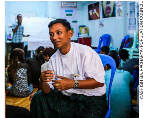
At the LOTUS center in Yangon, young peer educators counsel young MSM on sexual health and HIV and STI risks as a part of Link Up's peer education activities.

The baseline data collection took place from June to July 2014, prior to the launch of Link Up's MSM activities in Myanmar. Across six sites (three intervention and three comparison sites), a total of 623 MSM were recruited via respondent driven sampling, a peer-