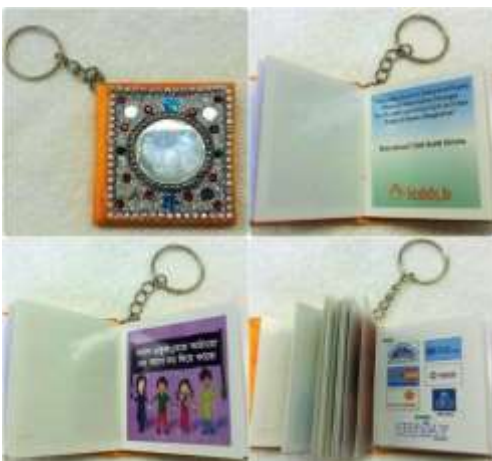
Fig. 2: Family planning picture book

Throughout the project period, 1,709 girls aged 15-19 years participated in these clubs. MAG club meetings took place in 10 brac primary schools within the two slums, Kamrangirchar and Mirpur. An average of 20 married adolescent girls participated in each session, each of whom could attend up to 12 club sessions (one per month) during the one-year intervention period (March 2015-Feb. 2016).