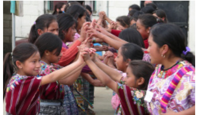
Abriendo Oportunidades creates safe spaces and provides mentors for Mayan girls.

The Population Council’s intensified focus on adolescents began in the early 1990s, accompanied by a commitment to move the field of adolescent research and programs from one often narrowly focused on sexuality, reproductive health, and behavior to the broader social and economic issues that underpin adolescent health and well-being.